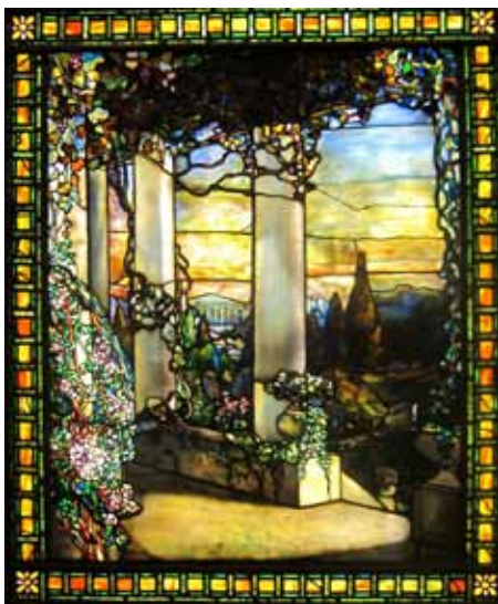
Landscape with a Greek Temple by Louis Comfort Tiffany

This spring take some time to look at our local stained glass. The windows you see in many of our churches and homes is actually the product of a fierce battle between two New York City artists. The American stained-glass movement of the late nineteenth- and early-twentieth centuries forever revolutionized the art of stained glass. Artists John La Farge and L.C. Tiffany challenged six-centuries of stained-glass tradition to form their own patented style and radically new subject matter.