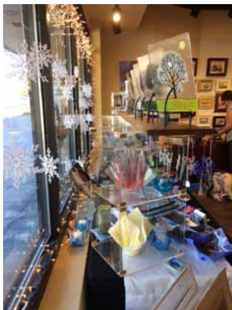
Scenes from last year's BRAA holiday market, held in the Community Arts Information Office on College Avenue in Blacksburg.

More information and registration details are linked to the BRAA home page at www.blacksburgart.org/ . If you are interested in providing planning assistance, email ccarrerad@aol.com or call 540-951-1700.